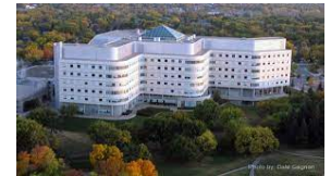
Saskatoon City Hospital

Jim Pattison Children's Hospital is located on the University of Saskatchewan campus.