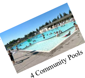
4 Community Pools