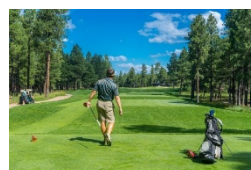
6 Golf Courses